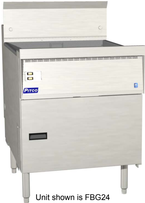
Unit shown is FBG24

Model FBG18 and FBG24 Flat Bottom Gas Fryers