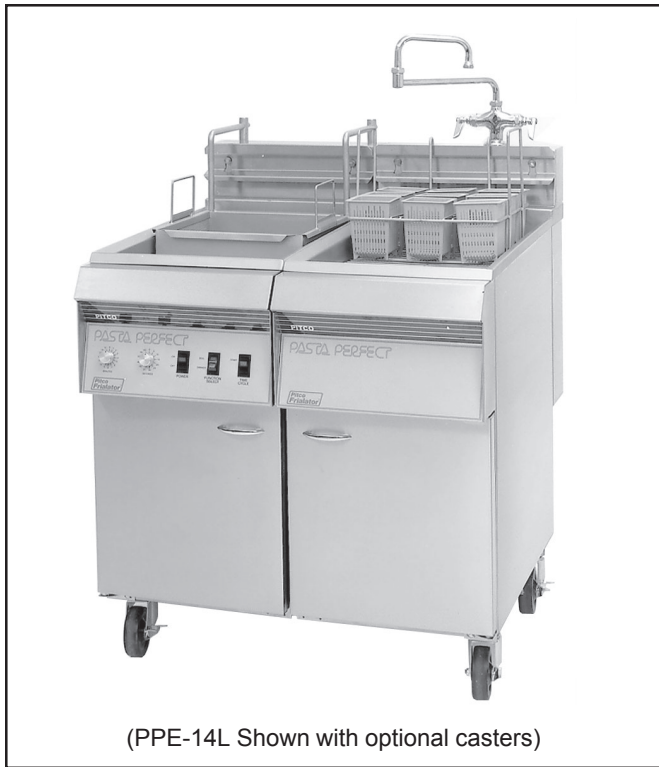
(PPE-14L Shown with optional casters)