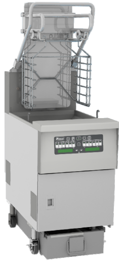
SGLVRF Shown with K12 computer, 9" front / rear casters