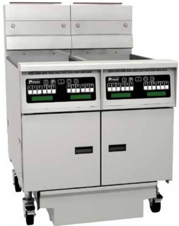
SG14R-2 shown with optional 12 button computer control, filter drawer, & casters

*Available with upgraded controls. Millivolt thermostat standard on Solstice Gas Fryers.