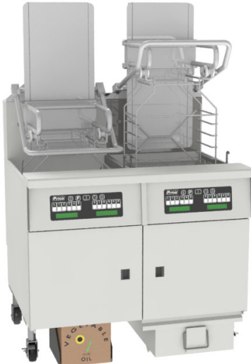
SGLVRF DUAL Shown with K12 computer, 9" front / rear casters