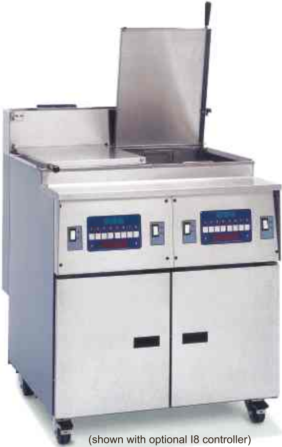
(shown with optional I8 controller)